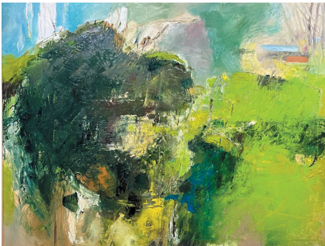
Garden at Salobert by Ian Warburton