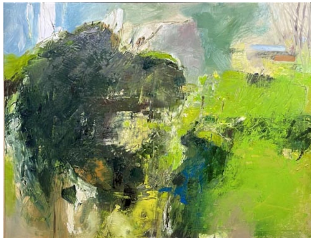
Garden at Salobert by Ian Warburton