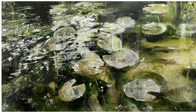
'Water Nymphs' detail by Pip Jones