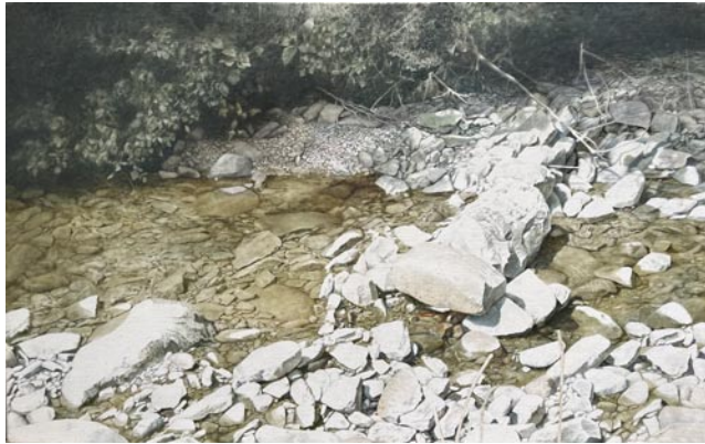
Stream bed